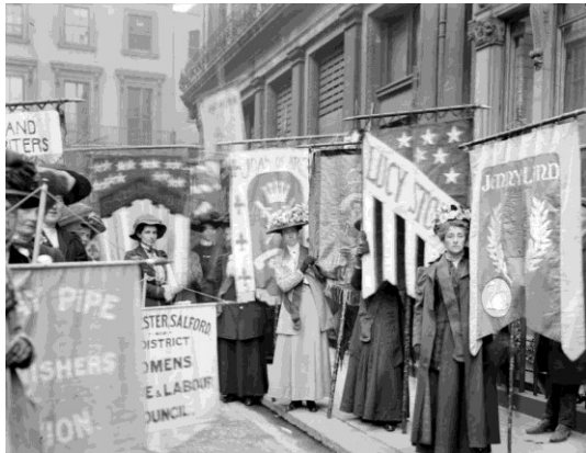
Suffragists at a pageant by the National Union of Women's Suffrage Societies. June 1908.